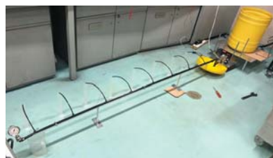
Fig. 3 Experimental test-bench

The results of the experiment conducted to determine t(p \rightarrow p_{atm}) are reported in Table I. Next, the actual pump activation time computed using (7) was 53.26s. Then, a new experiment was performed to characterize the system after its calibration. The system was started with the distribution line full of NS and the new t_{pump-on} was set for pump activation time. The obtained results are reported in Table V. The RMSE and UC obtained from each repetition of the experiment were computed and shown in Table II. The repeatability of the system was calculated using (4) through (6). The following results were obtained: