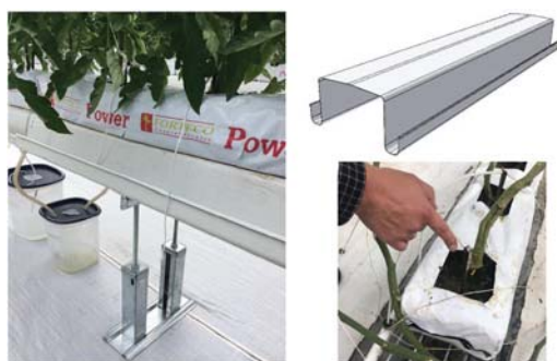
Fig. 2 Implemented Distribution Module