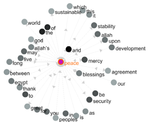
Fig. 3 LancsBox's Collocation Graph of peace