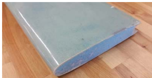
Fig. 4 Complete wing core with fiberglass skin

of the airfoil, using the numbers on the template as a cadence for speed to ensure that both sides of the cutter are at an equal pace to smoothly cut through the foam core. The finished product, Fig. 4, will be a foam core section of the wing, and this process will be repeated multiple times to achieve the desired wingspan [4].