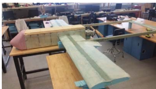
Fig. 5 Large scale UAS under construction

In order to validate the cost savings and ease of workability of composite materials in UAV construction, the researchers are currently constructing a 4 m wingspan, 3 m fuselage, 75 kg UAV. They are using the techniques described in this document. The UAV, Fig. 5, is being built by a team of graduate and undergraduate students.