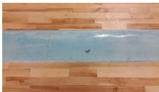
Fig. 5 Three core wing section

A benefit of using a hotwire cut foam core is that a UAV designer can quickly build a series of wings using different airfoils. An experienced builder could cut a 2 meter wing from a solid block of styrofoam in less than an hour. The builder could then apply epoxy coated fiberglass to the core in a few hours resulting in a fully cured, aerodynamic wing in the following day. Fig. 5 shows a three core wing section with fiberglass skin. Also, a computer controlled mill could be used to cut the foam into complex shapes. Several low cost commercially available machines exist. Due to the ease of the application of fiberglass and epoxy onto the foam, the designer is able to quickly create aerodynamic surfaces or shapes that would be difficult to build from aluminum.