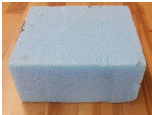
Fig. 3 Aerospace grade Styrofoam

The core of the composite structure is made of a low density aerospace Styrofoam. This material, Fig. 3, is blue and has high compressive strength. It acts as a mold during the wet layup process that shapes the fiberglass during impregnation with the epoxy resin system. The Styrofoam can be cut using a hot wire saw, which may be constructed relatively easily using few materials. The hot wire saw used by Rutan can be created using a wooden beam, approximately 4 feet wide, with two stainless steel rods fixed perpendicularly to the wood on each end. The span between the rods is connected by a .032" stainless steel wire. Using a direct current power source, the positive and negative ends are individually connected to the rods. The current causes the wire to heat up due to the internal resistance of the electrons moving through the wire [4]. This hot wire is used to cut the Styrofoam core [8].