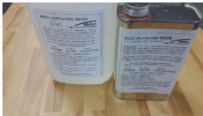
Fig. 2 MGS Laminating Resin and Hardener

The epoxy system, Fig. 2, used to construct the fiberglass layers over the Styrofoam core, is certified by the German Federal Aviation Administration for use with aramid, carbon and glass fibers for high static and dynamic loads. The manufacturer of the two part system is Hexion Specialty Chemicals. All manufacturer's instructions and recommendations should be followed when using the products because of their chance to cause minor irritation to epidermal tissue [11].