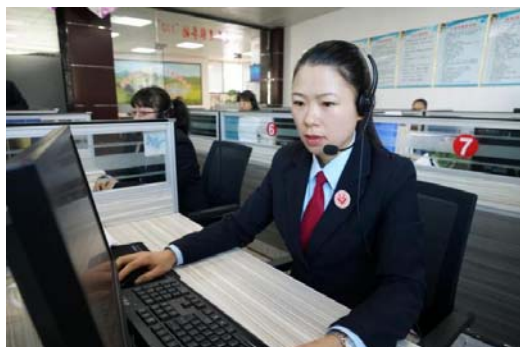
Fig. 2 Staff of home care information service center of Daitian Zehui is tracking the elderly service objects

survey and other forms of evaluation and scoring, service providers or service personnel of poor service quality resolutely gives search method, and timely expansion of new service providers and service personnel. At present, the center has been certified by 1S09001 quality management system.