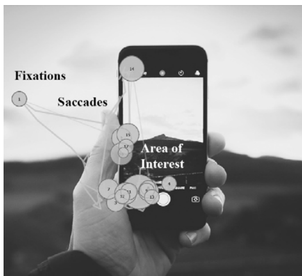
Fig. 2 Eye tracking illustration of a fixation/s, saccade, and AOI © Copyright 2018 iMotions [8]

Individual preferences and decision strategies of the target audience then becomes known. Next are some common metrics and terms used in eye tracking data collection.