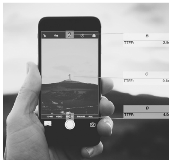
Fig. 4 Eye tracking illustration of TTFF © Copyright 2018 iMotions [8]

Fig. 6 demonstrates the output from the time spent viewing the 2D or 3D object used in the research study.