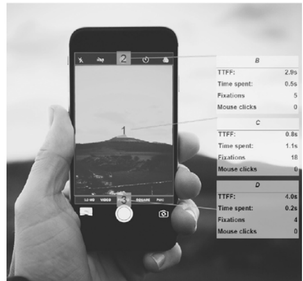
Fig. 8 Eye tracking illustration of the AOI [8]

Eye tracking metrics quantify visual attention driven by cognitive, emotional, and object viewing processes. Eye tracking is often combined with other biometric measurements for more comprehensive information [6].