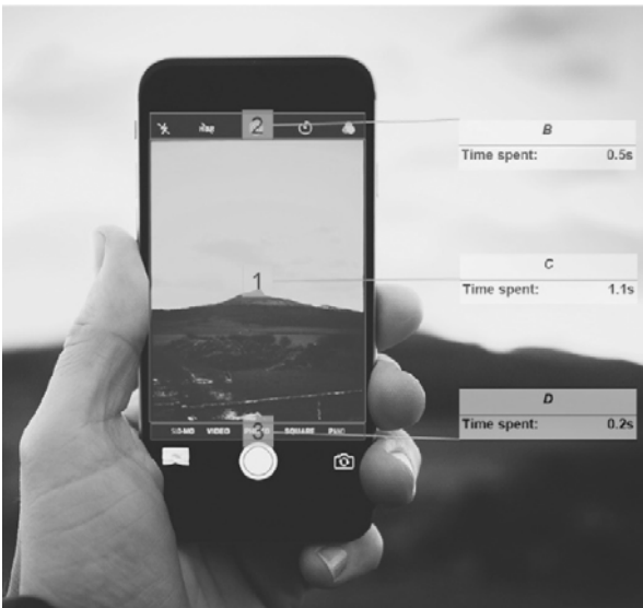
Fig. 6 Eye tracking illustration of the time spent [8]