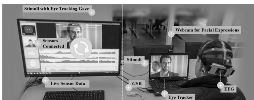
Fig. 1 Biometric lab © Copyright 2018 iMotions [8]

For screen based lab equipment, a solid table and a non-rolling chair are needed for the research participant to minimize extraneous movements. Direct sunlight needs to be blocked out since it can have a negative impact on eye tracking data collection. Low ambient light works best. Many of the products require specific computer setups and often use the PC platform. Two screens are needed, one for the study participant, and one for the researcher. One hard drive can be used with both monitors attached. The researcher needs to turn off all unneeded software to avoid participant distractions during the data collection process. All lab workers need to be trained to follow simple written protocols, to preserve consistency to maintain the validity of the study data collected [7]. Fig. 1 shows an example of how an eye tracking lab can be set up.