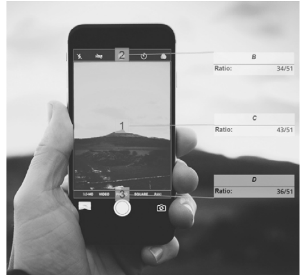
Fig. 7 Eye tracking illustration of respondent count [8]