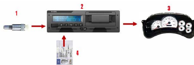
Fig. 1 Components of the tachograph system

The digital tachograph systems consists of the vehicle unit (VU) (usually referred to as the tachograph itself) (2), motion sensor (1), and smart cards (4) used in the system as shown in Fig. 1. The VU is also used to drive the vehicle cluster (3).