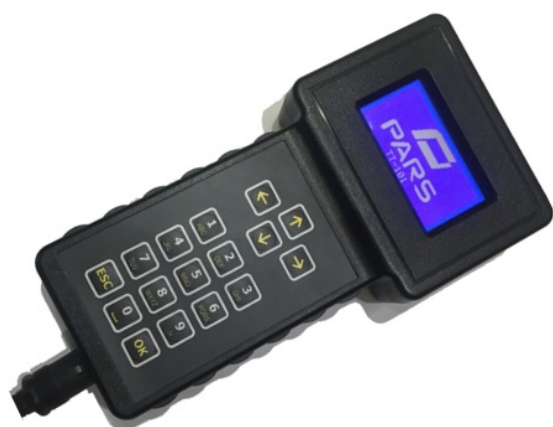
Fig. 3 Calibration device used to input parameters into VU

The Pars TT-101 calibration device is shown in Fig. 3. A tachograph calibration device is used to input parameters and values into the tachograph. This calibration device is directly connected to the VU through the front connector of the VU. This connection enables the calibration device to concurrently count pulses received by the VU (from the motion sensor) as well as enables simulation of vehicle speed so that the workshop can test if the VU displays speed and odometer information correctly and the vehicle cluster is driven successfully. Every workshop is obligated to possess a calibration device.