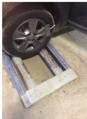
Fig. 4 Rolling road for automatic calculation of K -factor

change as a result of the current position of the gearbox.