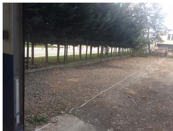
Fig. 5 Manual calibration using a 20 m track

In the manual calibration case, the workshop setups a track of 20 m length and the vehicle is physically driven along this track. In this case, the calculation of the pulses can be triggered either using an optical system as shown in Fig. 5, where the optical systems triggers the calibration device to start and stop counting pulses using reflector located at the beginning and end of the 20 m track that reflect the light beam send out of an optical device that is connected to the calibration device. Alternatively, the workshop personal can hit the start and stop count buttons on the calibration device while the vehicle enters the 20 m track and it arrives at the track end. In the latter case, there is an additional error source introduced, which is the response time of the workshop personal to recognize vehicle position and response time to hit the button.