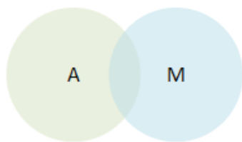
Fig. 3 Evaluation Metrics Strategy