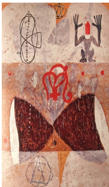
Fig. 4 Uttara Bakary, Untitled

protruding forms achieved with new unconventional paint media as indicated in Fig. 5.