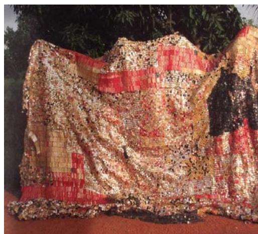
Fig. 7 El Anatsui, Society Woman's Cloth