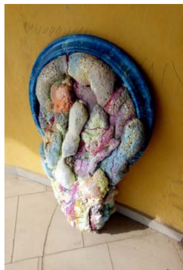
Fig. 6 Bolaji Ogunwo, (2018) Spill , Acrylic, Polyhol

Western, defined ceramic floor tiles are not rejected when broken. They are simply re-used in a stylized way even to satisfy the same preservative and decorative desires of an unbroken one.