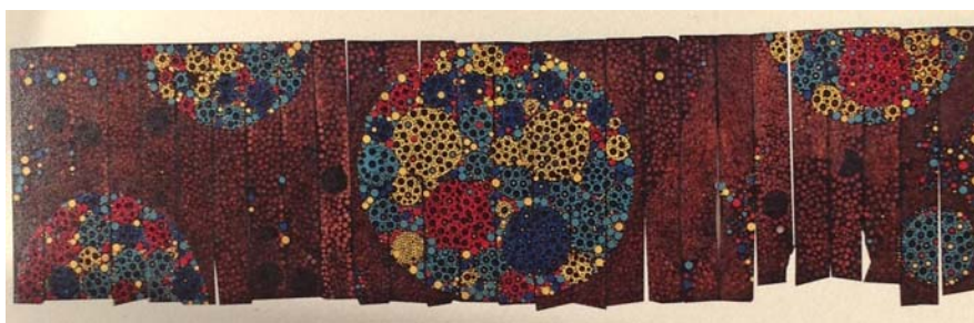
Fig. 3 Erasmus Onyishi (2018) Celestial Realm , Synthatic Fibre, Glue, Nails, Acrylic and Mahogany

Open Science Index, Humanities and Social Sciences Vol:13, No:6, 2019 publications.waset.org/10010499.pdf