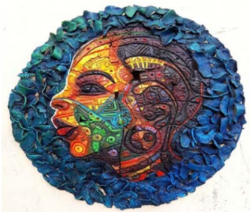
Fig 5 Chuks Chukzmore, Black is Beautiful , Acrylic

The traditional bullet proofs, e.g. the Benin or Idah Soldier with "Coat of Mail" , as shown in Fig. 7, is made entirely of metals or shells of resilient nuts. So either way, it could be metal or wood sculpture. This is not the case with El Anatsui's logoligi or Society Woman's Cloth .