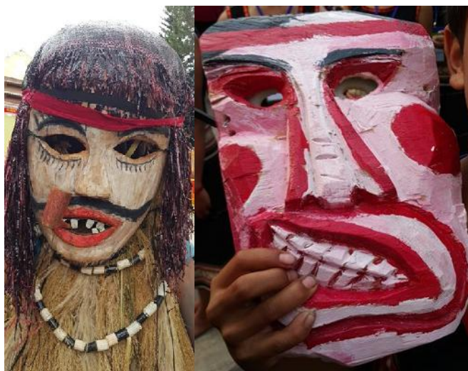
Fig. 11 Bahnar masks, K'Bang district, Gia Lai Province, Vietnam; Photo: Nguyen Thi Kim Van

The preference for red and choosing it for the main color in decorative patterns could be seen in a series of other products in the Bahnar's living space until nowadays. One explanation for this was confirmed by some Bahnar people when we interviewed them at field trips, that they used to have products made at festivals, such as masks (Fig. 11), with red from the blood of the sacrificed animals and the black of charcoal. Later, although a lot of modern materials are imported from the outside, such as oil paints, they still chose the red and black to paint on the mask and many other things in the festivals.