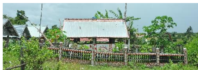
Fig. 3 A tomb-house in Kong Chro district, Gia Lai province, Vietnam; Photo: Nguyen Viet Tan (2018)

Similar to the other ethnic groups in the Central Highlands, the Bahnar had three main architectural types, including dwelling-houses, a community house (Roong), and tomb-houses. The dwelling-houses of other ethnic groups were rarely decorated with motifs except for some wooden sculptures on the stairs and on the main beam (as in the case of the double beams separated the long house of the Rahde into 2 parts: Ôk and Gah). Particularly for the Bahnar, they decorated all of those architectures with decorative patterns, usually on knitted bamboo. The colors of those decorative patterns on architectures included only red on a white background or a light grey background of a non-dyed bamboo material (Figs.