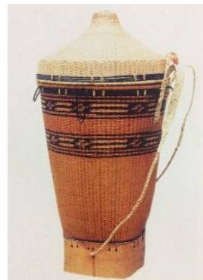
Fig. 8 A rattan basket for keeping clothes of the Bahnar, Gia Lai province, Vietnam [4]

Comparing the color schemes of the Bahnar, Jrai and M'ngong people through some samples of brocade (Figs. 7, 9, 10), it was easy to see that the number of colors used was increasing, however, the richness of shape and size was decreasing.