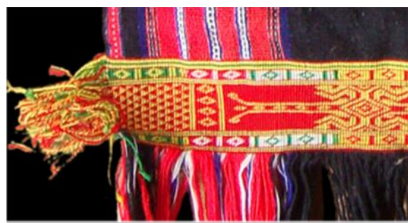
Fig. 9 The color of Jrai ethnic group, Gia Lai province (North Central Highlands of Vietnam); Photo: Thanh Nga & Huyen Ly

Comparing the color schemes of the Bahnar, Jrai and M'ngong people through some samples of brocade (Figs. 7, 9, 10), it was easy to see that the number of colors used was increasing, however, the richness of shape and size was decreasing.