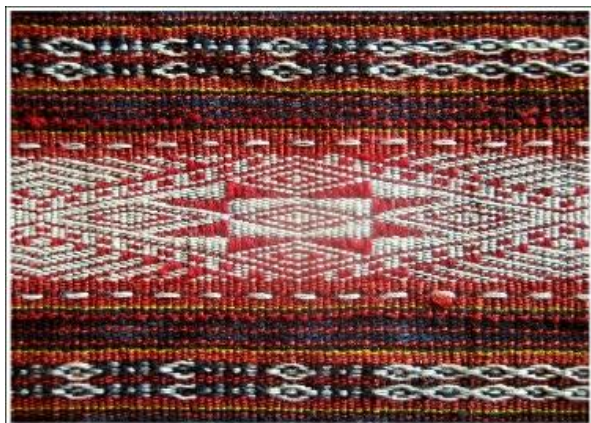
Fig. 7 The Bahnar's decorative patterns in brocade, Gia Lai Province, Vietnam