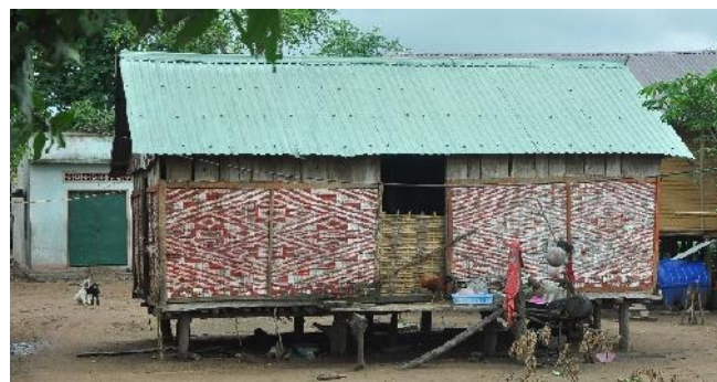
Fig. 2 A dwelling-house in Kong Chro district, Gia Lai province, Vietnam

A weakness of the valuable report of Tu Chi was that the drawings were printed in black without any notes about colors, and the printing quality was very low due to the limitation of technical ability in Vietnam at that time. There were also a few colored drawings for illustration but they might have been inaccurate with reality because they looked very different from the photos in this book. Based on the list of 26 black-printed patterns in the book of Tu Chi, we made a review of the decorative patterns in the living space of the Bahnar in Kong Chro recently (as a case study) in order to confirm the way that the Bahnar used colors in their decorative patterns.