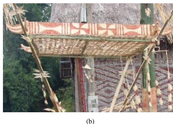
Fig. 6 (a) A tomb-house, Dak Po district; (b) a pedestal ritual, Kong Chro district, Gia Lai Province, Vietnam.