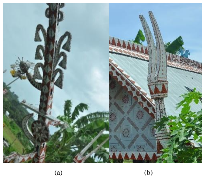
Fig. 5 (a) The shape of the vegetable Don (b) Buffalo horns, Ya Ma Commune, Kong Chro district, Gia Lai Province, Vietnam; Photo: Nguyen Viet Tan (2018)

As mentioned in the overview, the geometry shapes in the Bahnar's decorative patterns might have been the consequence of knitting techniques. But later, it might have led them to choose geometry shapes as favorite options even in sculpture or painting although they are no longer dependent on knitting techniques (Fig. 6).