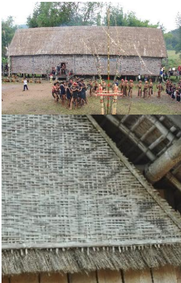
Fig. 4 A community house in Kong Chro district, Gia Lai province, Vietnam; Photo: Nguyen Viet Tan (2018)

As we could see in the three examples of architectural decoration in Figs. 2-4, the star/sun was the main motif shown in the center, surrounded by triangular stripes which were inspired by the shape of some types of leaves that Tu Chi sorted in the fourth group. Triangular and straight line patterns were most commonly used in all three types of architecture. However, it could be clearly seen that the level of decorative details increased from dwelling-houses to community houses and much more in the tomb-houses. In addition to the walls, the community houses were also decorated on top of the roof, stairs, front yard, and the frames of the doors. Decoration in the tomb-houses included the surrounding statues and other kinds of sculpture, there are mainly vegetable motifs, animal horns and geometric motifs. They were also added by colorful drawings after carving (Fig. 5).