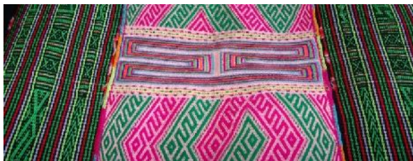
Fig. 10 The color of M'ngong ethnic group, Dak Nong province (South Central Highlands of Vietnam); Photo: Nguyen Thi Kim Van

pink, and more colors in other examples. M'ngong people could be said to have a variety of colors in their brocade to set up a lot of colorful combinations, so they might have selected the same shape and size in decorative patterns to avoid messing up the work. In decorative patterns of M'ngong's handicrafts, the main part and the side stripes were distinguished by main colors using in each part (pink and green), but their shape, size and details were set up similarly.