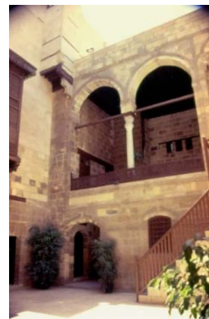
Fig. 4 The Courtyard

The section shows the house main lounge (al-Qa'a) and the Shukhshikhah (skylight) at the top of roof to provide cross ventilation [6].