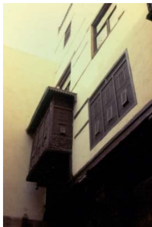
Fig. 5 The Mashrabiya

climate, in addition to the influence of Somali traditions, since the area is fronting Somali on the Red Sea (Figs. 6 and 7).