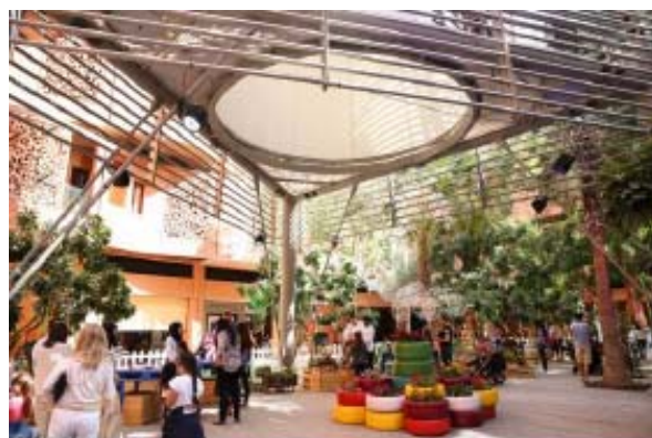
Fig. 17 External Yards, Masdar City, Dubai [16]