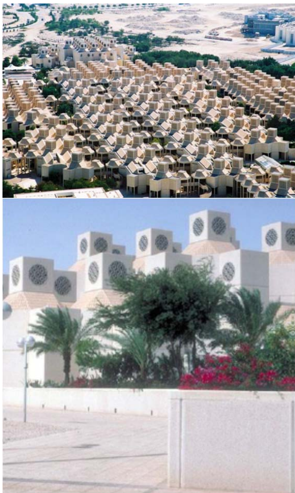
Fig. 15 Wind Catchers (Malkaf), Qatar University Campus, Doha [15]