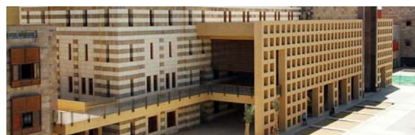
Fig. 14 American University Campus, New Cairo [13]

The planning and design of the American University new campus, which is located in the New Cairo Community, and designed by Architect Abdel Halim Ibrahim, opened its doors for the first classes stated in the fall of 2018. The new 260-acre campus was planned and designed as "City of Learning" to serve 7,000 students. The plan contains several elements from local Islamic architecture in Egypt, such as court yards, wind catchers (Malkaf), which work as a cooling element and provide continuous cross ventilation, as well as the Mashrabiya that provide both ventilation and privacy, which combined reflect the local and traditional architecture in a modern way (Fig. 14) [12].