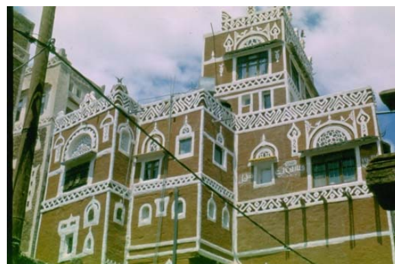
Fig. 9 Traditional house in Sana'a city (mud bricks construction)