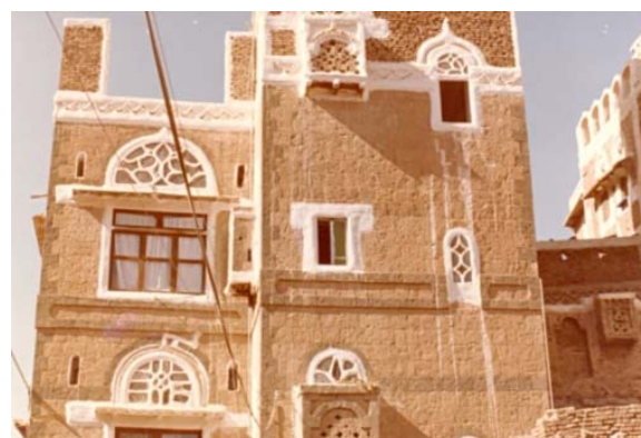
Fig. 10 Traditional house in Sana'a city (stone construction)