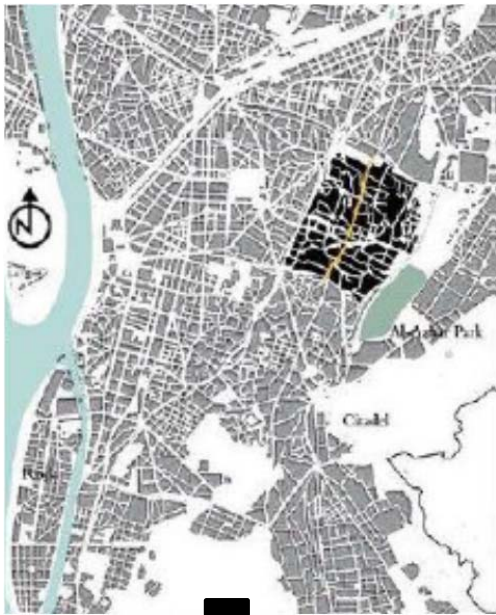
Fig. 1 Fatimid Cairo City Map [4]

(Sabil) and school (kuttab), spiritual retreat (khanqahs), and Inn (Wakkalah) and commercial buildings. Fig. 1 shows Fatimid Cairo City Map.