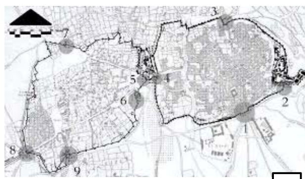
Fig. 8 Map of Old Sana'a City, Yemen [9]

A traditional house in Sana'a city is considered unique from other parts of the country, and is characterized by its multiple floors which could reach from 5 to 7 floors in most cases, and are either constructed from stone or of a mixture of both stone and mud brick (Figs. 9 and 10).