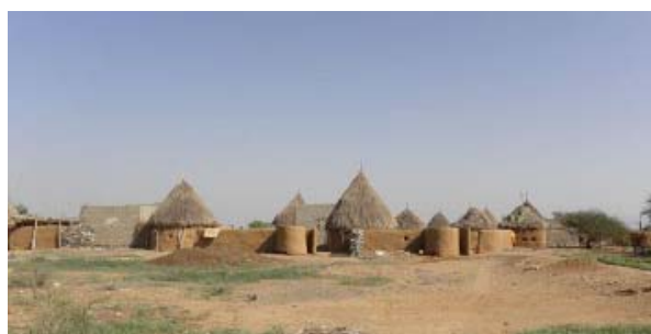
Fig. 7 Group of mud and reed huts, Tihama, Yemen [7]