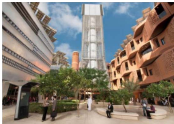
Fig. 16 Widows Opening, Masdar City, Dubai [16]

the United Kingdom, and the Leadership in Energy and Environmental Design (LEED) in 1993, in the United States. Meanwhile, there was an early attempt for sustainable architecture applications in 1946 by Hassan Fathy in the design of New Gourna Village, in Upper Egypt, and in 1960, by Frank Lloyd Wright when he raised eco-awareness through his works with nature.