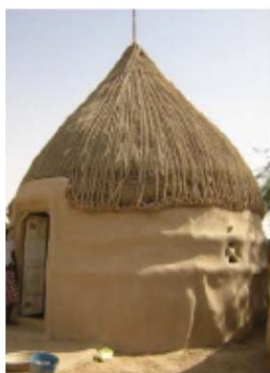
Fig. 6 Mud and reed hut, Tihama, Yemen [7]