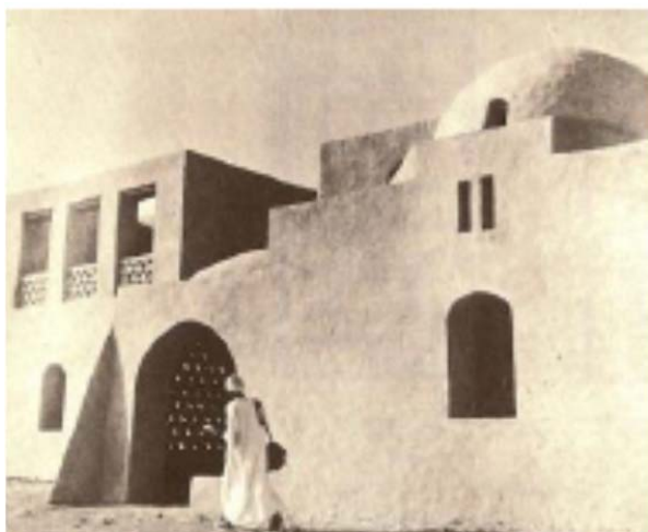
Fig. 12 The New Gourna Village, Nubba, Egypt [11]

The design of the New Gourna village in Upper Egypt reflects Fathy's philosophy which is targeted as architecture for the people. He applied the principles of Egyptian Vernacular, traditional architecture, and low technology through the use of mud that is the most available building material. The court yard, the domes and vaults were examples of traditional architecture elements. In addition, there were small openings to adopt environmental conditions and are considered sustainable (Fig. 12).