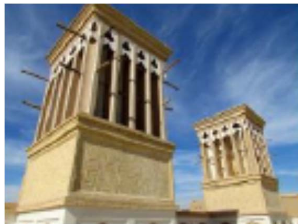
Fig. 13 Wind Catchers in Dubai [12]

The wind catchers found in the traditional house in Dubai is considered one of the main architectural elements of homes in other Arab regions. Fig. 13 shows the wind catcher in a house in Dubai.