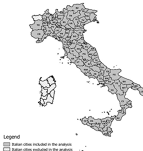
Fig. 1 Italian provinces under study

In this manuscript, an empirical analysis has been carried out with the aid of a dataset containing information both on tourism and transport for 99 Italian provinces, during the 2006-2016 period (see Fig. 1). In Figs. 2 and 3, the population and the GDP of the 99 provinces considered for this analysis are reported in order to give an idea of their main socio-economic characteristics. From Figs. 2 and 3, it is possible to deduce that the provinces with the highest GDP and population are those of Milan and Rome.