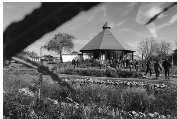
Fig. 1 Orrefors Park in October 2017.

of the landfill in a form of a recreation park. The same idea can be used to remediate and recover the glassworks sites in Småland after excavation by combining the knowledge gathered from the Estonian project and the talents of the glass artists in Sweden to build a phytoremediation tourist glass park in a selected old landfill site in Småland like the Boda glasswork in Emmaboda.