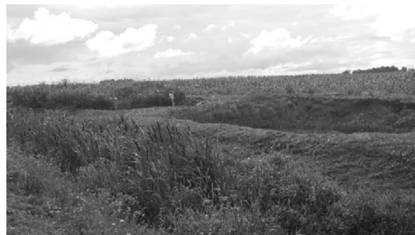
Fig. 3 Subsurface constructed wetland in the farm Mezaciruli, Latvia.

throughout the year by 68% and 53%, respectively, when concentrations at the inlet and outlet were compared.