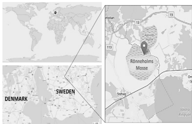
Fig. 2 Location of Rönneholms Mosse in Southern Sweden where the sludge samples were derived (authors' workout using GeoHack Globala Karttjänster and Google Maps)

The quantity and character of the deposited waterlogging in Rönneholm's area has fluctuated over the years, due to parameters such as the composition and degree of pollution of the raw water (Ringsjön and Bolmen), the amount of chemicals and the use of precipitates (iron chloride or aluminium sulphate) and the function and condition of the water treatment technology for sludge thickening and dewatering. The long term analysis was scheduled to discuss opportunities of using the sludge potential for possible aluminium, iron or even possibly rare earth elements extraction from the sludge to industry needs [13]. However, results showed that these can be estimated as very hypothetic reserves of metals as concentrations even if high still lack processing options in sustainable way [14], [15].