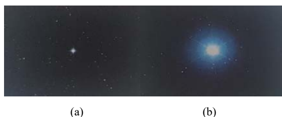
Fig. 2 Visual explanation of the difference between banjjak (반짝) (a) and beonjjeok (변쪽) (b)

Vowel ablaut, also known as vowel gradation, is one of the most common characteristics of ideophones in terms of sound symbolism. It consists of a systematic variation of vowels in order to slightly change the meaning of that word. For example, the ideophone banjjak (반짝), which is formed by light vowels, suggests something small and light that shines; while the ideophone beonjjeok (변쪽), where the light vowels have been changed into dark ones, depicts something big and heavy that shines.