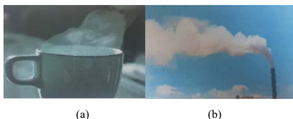
Fig. 3 Visual explanation of the difference between morak-morak (모락모락) (a) and mureok-mureok (무럭무럭) (b)

An additional example that proves the difference of meaning when using light vowels versus dark vowels is the ideophone morak-morak (모락모락) -formed by light vowels and mureok-mureok (무럭무럭) -composed of dark vowels. While the first one illustrates the way a small amount of smoke rises up quickly in the air, the second one describes the way a large amount of smoke rises up continuously, as is the case of smoke produced and emitted by big factories. Furthermore, the ideophone tong-tong (통통), which is composed by light vowels, describes a person who is plump or chubby in a positive way. However, on the contrary, the ideophone tung-tung (통통), which contains dark vowels, points out a person who is overweight, and contains a negative connotation that adds criticism and cruelty. In this way, due to its semantic detail, vowel ablaut can cause slight changes to the meaning of what is expressed.