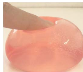
Fig. 1 Visual explanation of the word mallang-mallang