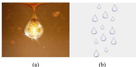
Fig. 4 Visual explanation of the difference between ttuk (툭) (a) and ttuk-ttuk (툭툭) (b)

Reduplication carries the meaning of continuity, repetition, intensity, emphasis, and plurality. [6] For example, the ideophone ttuk (툭), which has several meanings, describes the way something, singular and not plural, falls down suddenly. The reduplicated form of ttuk (툭), ttuk-ttuk (툭툭) emphasizes the way something, plural, falls down rapidly and with more intensity than ttuk (툭). In this case, reduplication suggests singularity and plurality, and emphasizes its semantic intensity.