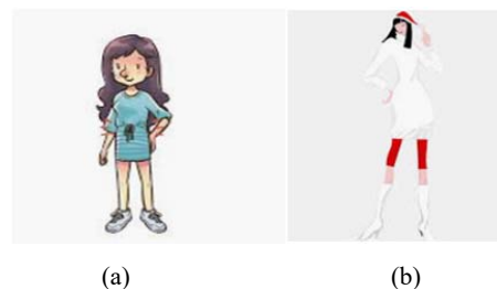
Fig. 6 Visual explanation of the difference between nalssin (날씬) (a) and neulssin (늘씬) (b)