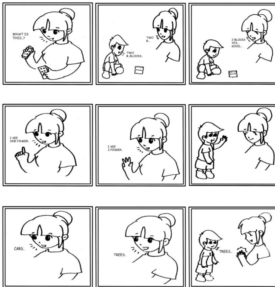
Fig. 2 The proposed and final illustration of written card file checklist number 45 of the language activities, the researcher draws the written text with three choices and asks the respondents if they understand clearly the given pictures; they responded that it is clear and show no revisions since they clearly understood the drawing pictures