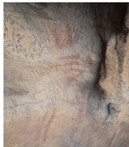
Fig. 22 Libyc characters

The set of characters of these two sites is about 91;