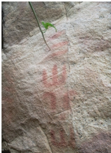
Fig. 11 Libyic characters