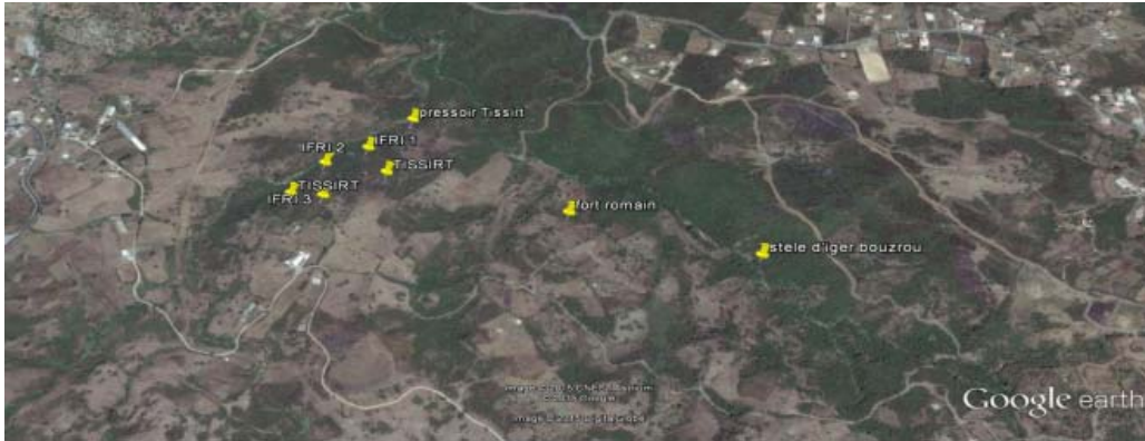
Fig. 4 Ifran sites