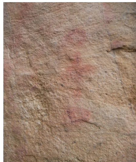
Fig. 9 Libyc characters