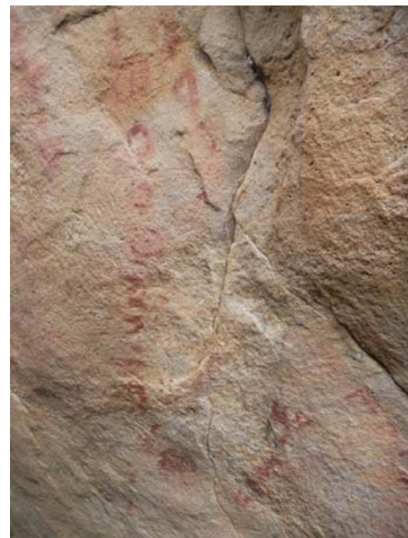
Fig. 8 Libyc characters