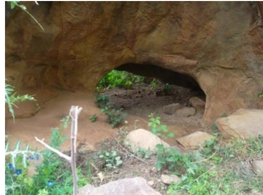
Fig. 19 Ifran II