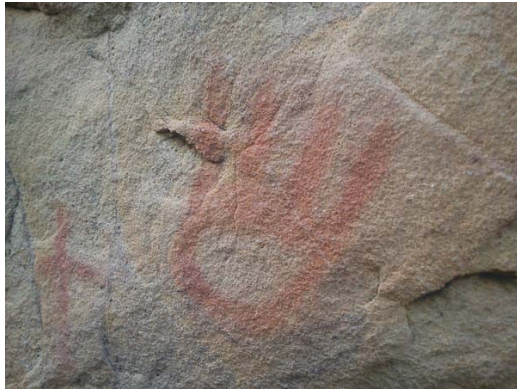
Fig. 16 Figurine