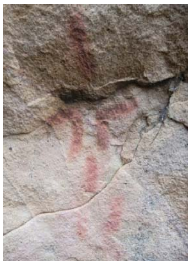
Fig. 12 Libyic characters