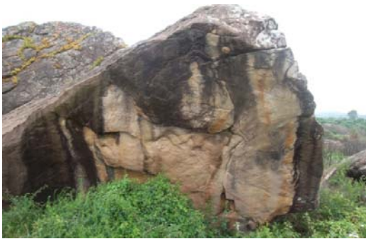
Fig. 5 Ifran I site