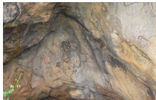
Fig. 20 Ifran II