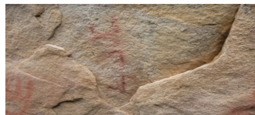
Fig. 15 Libyic characters