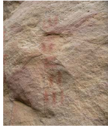
Fig. 13 Libyic characters