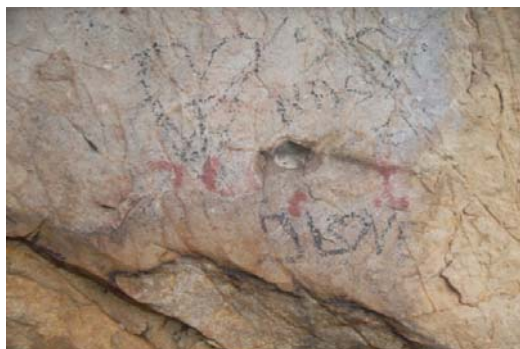
Fig. 23 Libyc characters