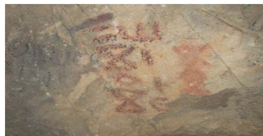
Fig. 21 Libyc characters