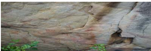
Fig. 6 Decorated wall with Libyc inscription