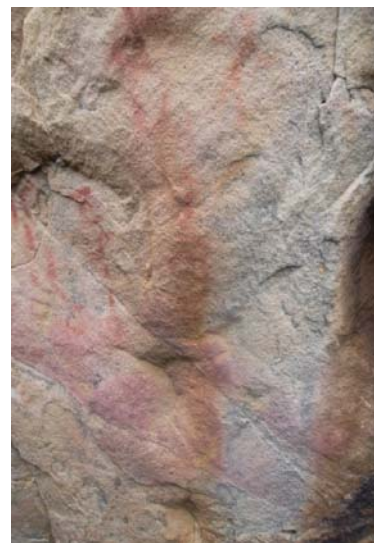
Fig. 14 Libyic characters