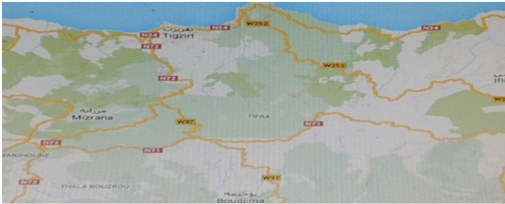
Fig. 1 Tifra region