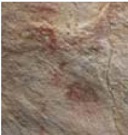
Fig. 17 Figurine