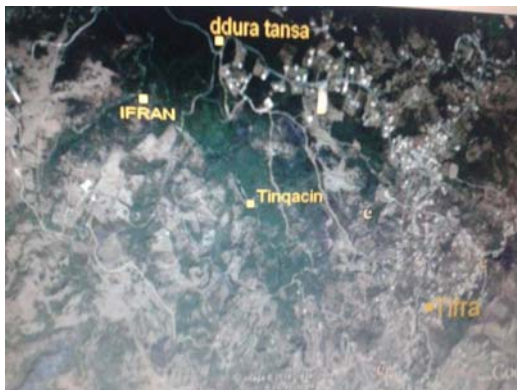
Fig. 3 Ifran sites