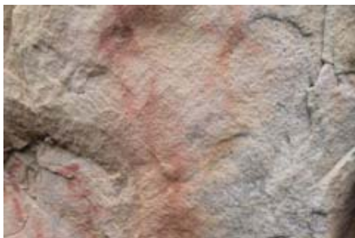
Fig. 18 Figurine