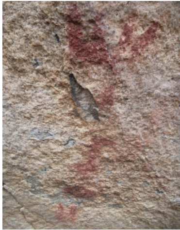
Fig. 10 Libyic characters