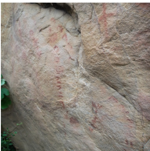
Fig. 7 Libyc characters