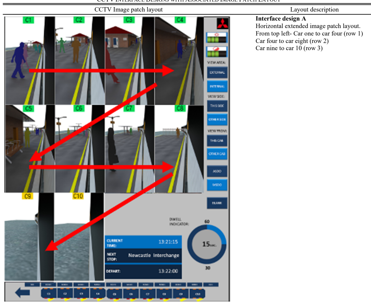
TABLE I CCTV INTERFACE DESIGNS WITH ASSOCIATED IMAGE PATCH LAYOUT

Participants were allowed to interact with the CCTV monitor during the operational scenario to reverse camera angles, or to enlarge the image patch whilst determining if the train was safe to depart. The number of CCTV monitor interactions performed by the participant was recorded by the system for further analysis.