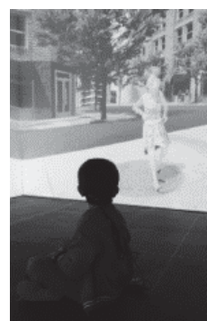
Fig. 3 Illustration of the VA stimulation while the avatar is dancing

and he/she went to the central wall. Here he/she ate a butter cake while the Olorama device threw a butter odor. Fig. 4 represents an avatar eating in the VAO condition.