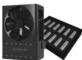
Fig. 1 Olorama Device

The IVE experience occurred in 9 minutes and 65 seconds and had 4 phases. Fig. 2 represents the first phase where the participant saw images of a forest and heard a relaxing music. This stimulation was considered the baseline.