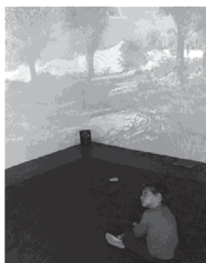
Fig. 2 Illustration of the environment in the baseline

The IVE experience occurred in 9 minutes and 65 seconds and had 4 phases. Fig. 2 represents the first phase where the participant saw images of a forest and heard a relaxing music. This stimulation was considered the baseline.