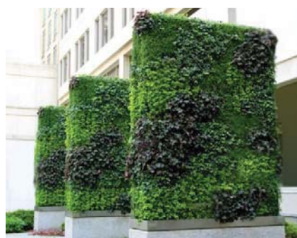
Fig. 1 Free Standing Green Wall

elements of the urban environment, the appearance of buildings and apartments can be mentioned which could be built creating in favor of sustainable [14] or biophilic [15] development. Combining traditional architecture and modern materials and technology has led to form present green facades and also to improve sustainable building functions [16]. Today, many different expressions are used to debating vegetated vertical building surfaces. For instance, free standing walls which called wall vegetation are used in Germany and made of brick and stone constrictions, are appropriate places for plant colonies to live in cracks, see Fig. 1 [17].