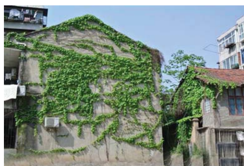
Fig. 3 Residential building with Ivy, Tehran

This matter manifests the great attention and respect of ancient Iranians for greening their lives. The exterior appearance of buildings in Iran was covered by climbers such as Ivy ( Hedera Helix ) and Grape ivy ( Ampelopsis ) form the old days. As Fig. 3 shows, seemingly they used the plants in that way just for decorating their buildings and not for their ecological or environmental effects [13].