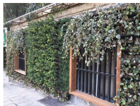
Fig. 5 Residential building, Tehran