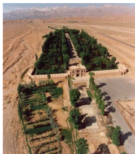
Fig. 2 Shazde Mahan Garden, Kerman, Iran

place representing Eden on the earth [31]. Ancient Persian gardens all transferred a mystical feeling for flavors and a great passion of garden. Supreme values and ideas are perfectly made evident and meaning, see Fig. 2 [32].