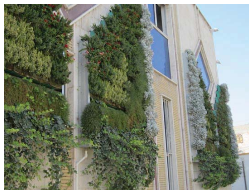
Fig. 4 Health paradise, Tehran