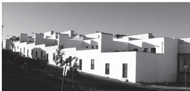
Fig. 1 Malagueira housing [15]

By the outbreak of the 1974 "White Revolution" in Portugal, and the downfall of near fifty years of dictatorship in the country, the new Portuguese Secretary of State for Housing and Urban Planning endeavored to eliminate the existing housing shortage issue. The Malagueira social housing project was part of a larger public housing plan in Evora. The objective was to establish 1200 affordable units on 27 hectares, for the lower and middle classes of society, by considering the region cultural characteristics [13]. Alvaro Siza was introduced by Evora's mayor to the municipality board as the only choice and solution to the housing crisis because of Siza's credit, regional practice, and housing experience in the Portugal region. Siza composed the elementary design concept and strategies during four months, and the final plans were endorsed by the board in November 1977. Of the 1200 residential units planned, 1100 units were built prior to July 1997, and construction was completed in 1998 [14].