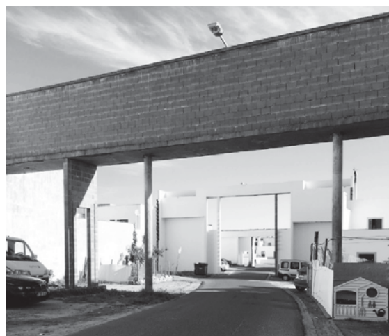
Fig. 2 Extended duct-walls in Malagueira housing [19]

Corbusier's concept of the Dom-Ino house and manifested its features in plans, facades, and volume, as shown in Fig. 3. In designing the exterior and geometry of houses, Siza followed the same pattern of Dom-Ino shapes that Le Corbusier used in a number of projects, including Pessac housing. Perhaps another example of this tendency could be found in the Malagueira plans; Siza returned to Le Corbusier's modular system, elegantly combining this concept with the existing Evora vernacular house schemes, and the Roman Golden Proportion to form the Malagueira housing plans. This syntax, which recalls the notion of "defamiliarization" of Critical Regionalism, demonstrates that "eternity" for an architect's work would appear through the consideration of the past and present as a mixture, as none would be everlasting individually.