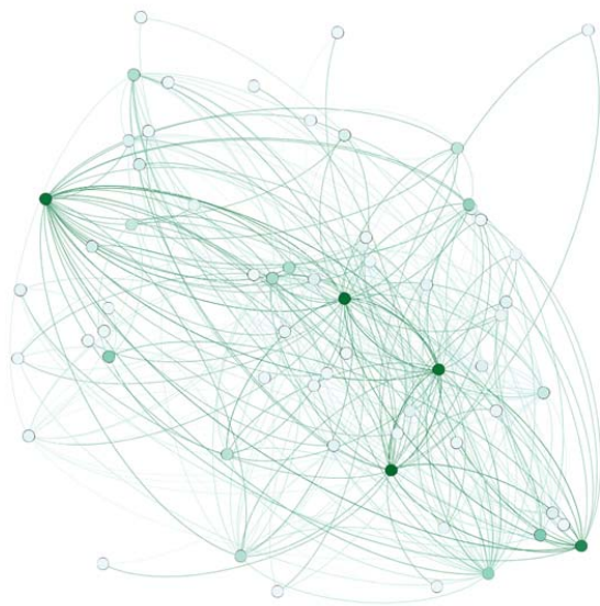
Fig. 2 Pro-Roma social network obtained with Gephi

There are several explanations for the observed patterns in hate crimes. It is a possibility that local current events impacted the frequency of hate crimes for certain years. For example, critical elections may have triggered spikes in hate crimes in certain nations. Furthermore, historical events in certain countries may be having an effect on the occurrence of hate crimes on Roma. It could be that those countries that had more occurrences of oppression in the past take a longer amount of time to change the mentality and sentiments that the larger population has towards Roma, thus explaining why certain countries have higher hate crime frequencies than others.