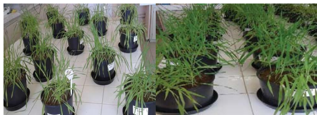
Fig. 1 A general view of pot experiment

This pot experiment was done greenhouse conditions in Namık Kemal University, Agricultural Faculty, Department of Soil Science and Plant Nutrition. Experiment was conducted according to Randomized Block experiment design with three replicates. Barley ( Hordeum vulgare L.) plant was used in this research for test plant. Cadmium (100 mg/kg) was applied as \text{CdSO}_4 \cdot 8\text{H}_2\text{O} forms to each pot and pots incubated during 30 days. Ethylenediaminetetraacetic acid (EDTA) chelate was applied to each pot at five doses (0, 3, 6, 8 and 10 mmol/kg) 20 days before harvesting time. Plants were harvested after two months planting. A general view of pot experiment in Fig. 1. Then plant samples were prepared for analysis and Cd and Zn concentration of plant samples were determined ICP- OES instruments [6]. Variance analyses were done between Cd and Zn concentration of plant green part. Also, pH, EC, organic matter amount, available phosphorus, exchangeable potassium, lime [7], available some trace elements (Fe, Zn, Cu and Mn), exchangeable Cd contents and texture class [8] of soil sample were analysed. Some physical and chemical properties of soil samples are given in Table I.