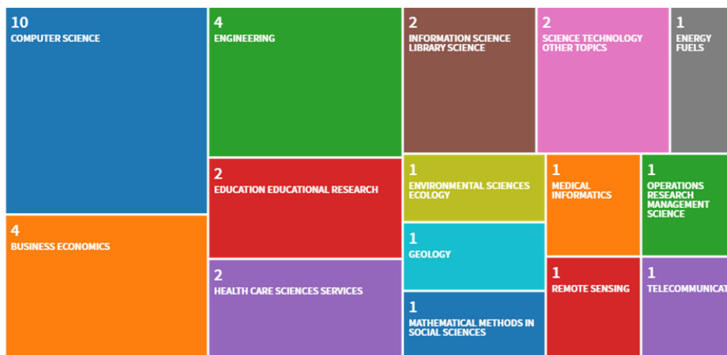
Fig. 1 Research fields within the WoS database of published articles and proceedings papers in 2018

WoS database from the digital transformation field, which have been reviewed for the purpose of this paper.