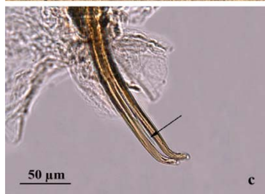
Fig. 1 Crenosoma petrowi found in the lungs from a stone marten from Bulgaria: a) Posterior end of the body. b) Spicules (1) and gubernaculum (2) under compression. c) Distal spicule ends. The arrow - spicule growth