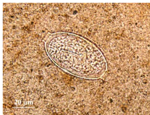
Fig. 4 An egg of Eucoleus aerophilus found in the lungs from a stone marten from Bulgaria (under compression)

C. petrowi has been established in Bulgaria [9], Italy [2], Spain [3] and former Czechoslovakia [4].