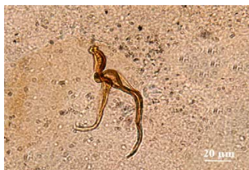
Fig. 3 Spicules of Sobolevingylus petrowi found in the lungs from a stone marten from Bulgaria (under compression)