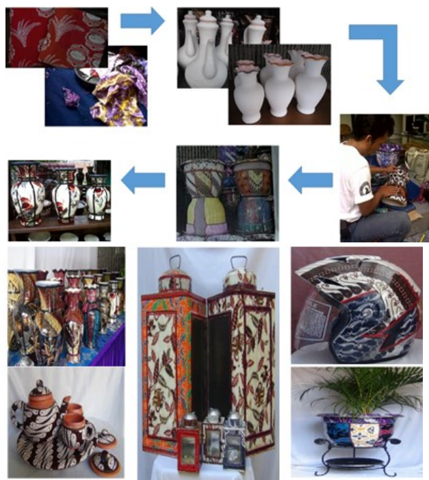
Fig. 2 Product of Mosaic Batik

Mosaic Batik is one of the innovations of clean production and creativity from the Institute of Course and Training (LKP) Bogor Batik which utilizes batik scrap waste, so there is no waste remaining (zero waste). Pieces of the batik patch then are used on the desired media, such as ceramics, plastics, pottery, cans, stainless, pillars of the house, and various other media by applying stick system. Fig. 2 shows variety of mosaic batik products that have been successfully produced and marketed by Batik Bogor SMEs.