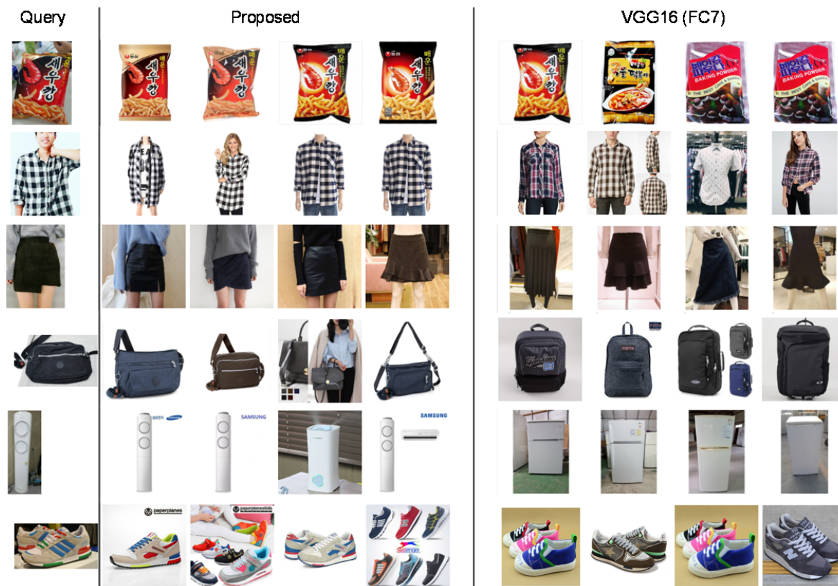
Fig. 3 Evaluating product recommendation performance from 2 million of online market database

classification and the cluster dataset consist of 34 classes of 17 categories and 3628 clusters, respectively.