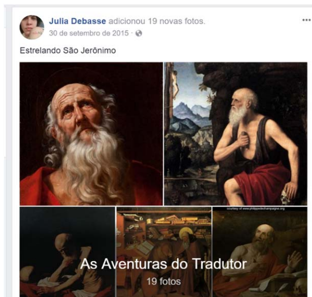
Fig. 2 Image collage and subtitles by Julia Debasse, available on the Group Translators / Interpreters

two groups, because, besides the fact of giving voice to translators, the groups also shine light over the profession's need for more appreciation. There is a "self-declaration" of being a translator and an attention to showing that the professionals do not only know how to translate, but also know how to discuss and defend their profession.