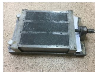
Fig. 5 Standard mortar prisms for testing of pozzolanic activity

Testing of pozzolanic properties showed that WSA has pozzolanic activity of Class 10, while WSSA has pozzolanic activity of Class 5. Results are given in Table V.