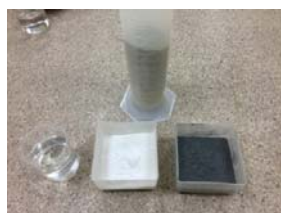
Fig. 4 Component materials for testing of pozzolanic activity

The pozzolanic activity was studied on specimens prepared according to the procedure given in SRPS B.C1.017-2001. Standard mortar prisms were prepared with biomass ash, slaked lime and quartz sand (Figs. 4 and 5). The pozzolanic activity was determined based on 7-day compressive strength.