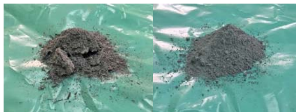
Fig. 2 View of WSA biomass ash before sieving and after grinding