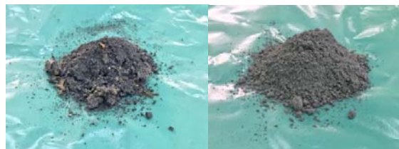
Fig. 3 View of WSSA biomass ash before sieving and after grinding