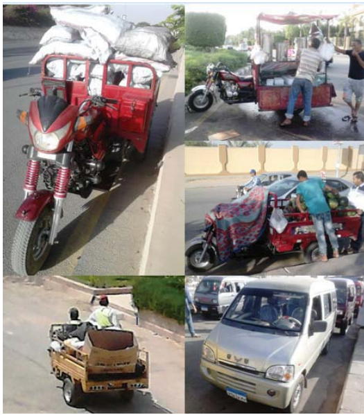
Fig. 2 Various kinds of vehicles used in small projects