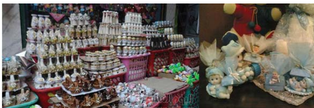
Fig. 4 The kinds of ceramic souvenirs gifted in celebrating sbou of the born child

The special interest of those communities to the religious events, old habits such as "Sbua of the born child (the seventh day of the born child)" and other habits and the relevance of that on buying certain goods and accessories, as well as the great passion to the football sport in particular, different ways of encouraging teams and even national ones throughout various leagues and occasions is also noticed (as shown in Fig. 4).