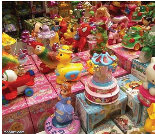
Fig. 1 Different shapes of Ramadan lanterns

appliances, construction tools, kitchen décor appliances and many other products can be easily noticed. Seasonal goods and products relating to social and religious events such as Ramadan lanterns, praying rugs, head wear, etc., can be widely spread and easily found (Fig. 1).