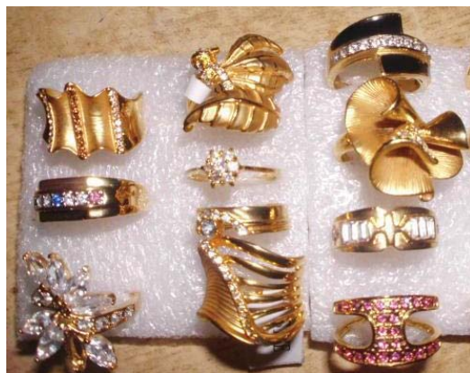
Fig. 3 Chinese gold

The special interest of those communities to the religious events, old habits such as "Sbua of the born child (the seventh day of the born child)" and other habits and the relevance of that on buying certain goods and accessories, as well as the great passion to the football sport in particular, different ways of encouraging teams and even national ones throughout various leagues and occasions is also noticed (as shown in Fig. 4).