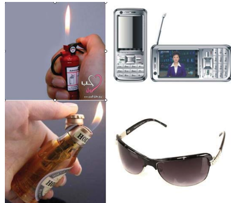
Fig. 5 Wealthy look products with added value

Not even ignoring wealthy range of people who like phenotypic, peculiar and distinctive behavior and are keen to draw attention, acquisition of fads that help to highlight themselves, Chinese have also made precious looking products having a certain added value which support the behavior of that range such as cell phones, sunglasses, lighters, etc. (as shown in Fig. 5).