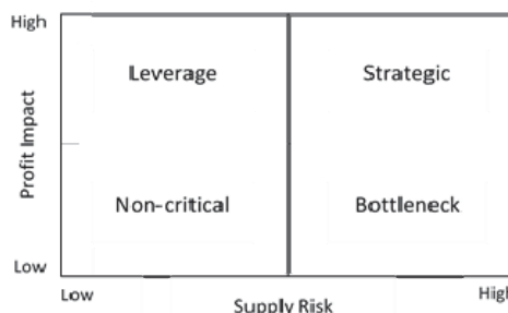
Fig. 1 Kraljic Portfolio Matrix [15]

The result is a 2 x 2 matrix (from "low" to "high") and a segmentation or classification into four categories: bottleneck, noncritical, leverage and strategic items; see Fig. 1. Each of the four segments or categories requires a different approach and separate supplier strategies based upon the mapping position of a product in the KPM. For "leverage items", buying companies are admitted exploiting its purchasing power thoroughly using for instance tendering, target pricing and product substitution. Although "routine items" are of relatively low value, they are ordered frequently, and high transaction costs occur. Therefore, category management with e-procurement solutions is an effective strategy to reduce transaction costs. "Bottleneck items" cause significant problems and risks, therefore strategies for instance volume insurance, supplier control, safety stock and backup plans are used to handle with bottleneck problems and risks. In certain cases, a search for alternative suppliers or products are introduced. "Strategic items" requires much more attention due to high-high feature and the most appropriate strategy for this segment is collaboration or partnership between buyer and seller [14].