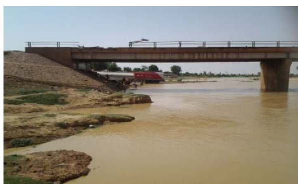
Fig. 2 At the Bridge (domestic and industrial activities discharge untreated effluent into the receiving stream)