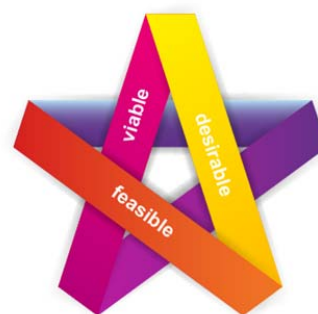
Fig. 1 Three criteria for design outcomes.

With the aim of providing European CIs with an innovative tool that allows them to offer new services and grow in the international market, Design Thinking has been used as a working methodology. The implementation of this methodology has been aimed at understanding and solving the real needs of the CIs, in order to align their needs with a technologically feasible and commercially viable solution, increasing their competitiveness (Fig. 1).