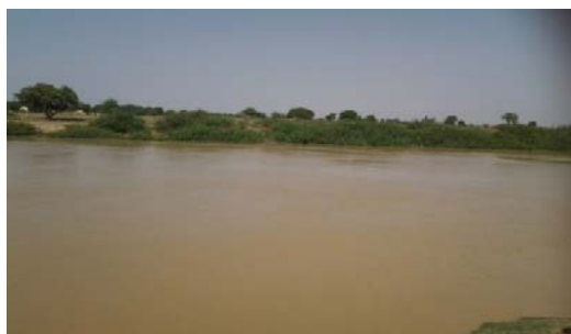
Fig. 3 Station C: Downstream (mostly preoccupied with agricultural activities and waste disposal)

The sampling bottles were pre-conditioned with 5% nitric acid and later rinsed thoroughly with distilled de-ionized