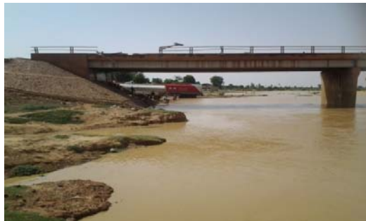
Fig. 2 Station B: At the bridge (domestic and industrial activities discharge untreated effluent into the receiving stream)