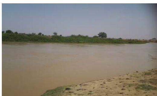
Fig. 1 Station A: Upstream, mostly consist of agricultural activities

Water samples were collected as described by [6], in two 1-liter sterile plastic containers from three designated sampling points in Jega River (fortnightly) between March and July 2014. Three locations were marked for sample collection, namely; Station A (before the bridge; upstream), Station B (at the bridge where human activities such as dyeing, car washing and laundry), and Station C (after the bridge; downstream). Figs. 1-3 show the pictorial presentation of the sampling stations.