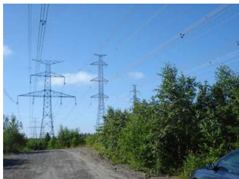
Fig. 1 Measurement site on a summer day