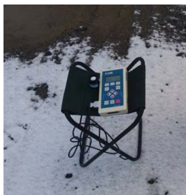
Fig. 4 Measurements of UV in winter