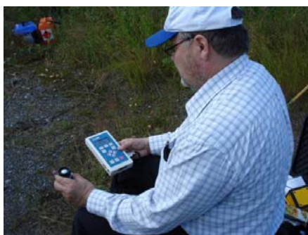
Fig. 3 Measurements of UV in summer