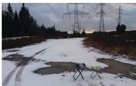
Fig. 2 Measurement site on a winter day