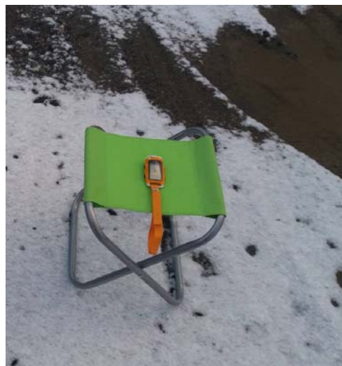
Fig. 5 Measurements of UV-index in winter

mW/m 2 (Table II). The measurements were taken in the middle of the day (11:00 – 15:00) on July 20 in Tampere Region, and these values represent the Finnish maximum values.