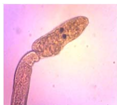
Fig. 6 (a) Brevifurcate-apharyngeate distome cercaria