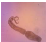
Fig. 6 (b) Brevifurcate-apharyngeate distome cercaria