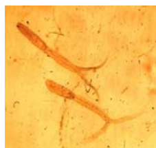
Fig. 8 Longifurcate-pharyngeate distome cercaria