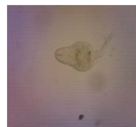
Fig. 5 Xiphidio cercaria