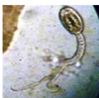
Fig. 7 Longifurcate-pharyngeate monostome cercaria