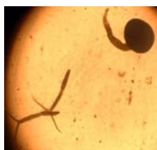
Fig. 9 Mixed infection with Longifurcate-pharyngeate distome and Gymnocephalus cercariae