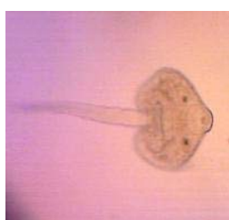
Fig. 2 Amphistome cercaria