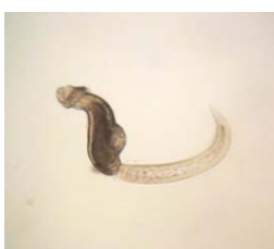
Fig. 3 Echinostome cercaria