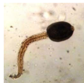
Fig. 4 Gymnocephalus cercaria