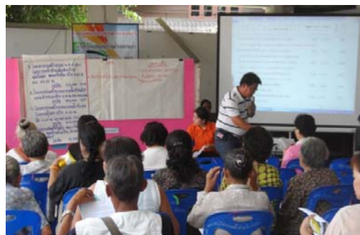
Fig. 3 Public meeting