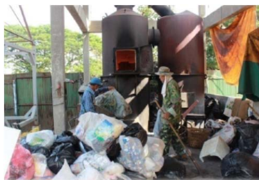
Fig. 2 The waste process

The correlation between the medial uses index and well-being is examined in the absence of controls. The analysis revealed a correlation of traditional media, interpersonal media, mass media, and new media. Meanwhile, the test of Hypothesis 2 is rejected that communication usage is related to happiness (using Pearson correlation r= 0.422 , sig 0.00 < 0.05 ). It is indicated that the relationship of communication type, which is interpersonal communication, has a relationship to the well-being of local people in the Donkeaw Community. The mass media have visited the area and reported on the success of community endeavours such as the ‘waste bank’ project and their award for transparency, public participation in community affairs and good governance. This is indicative of the openness and community spirit of the people in the area.