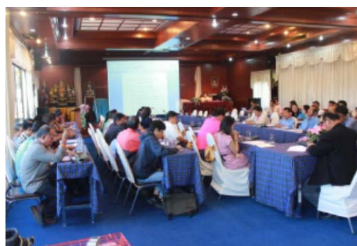
Fig. 4 Budget meeting