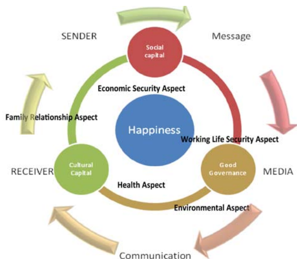
Fig. 7 System shows how communication affects people's well-being

group, cultures would soon disappear. Nonetheless, it can be said that from an economic viewpoint, culture and social relations are capital. If both are incorporated in a tourist activity, it would increase income for everyone. This may be good for smaller more isolated communities, as it would provide more economic advantages for local people, and therefore they would be less inclined to move away to search for work. The following illustration depicts this conclusion: