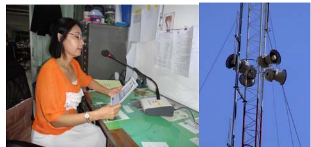
Fig. 6 Public Address System in Donkeaw Local Area

With an increase in communication within a group more is shared, structure develops, with the result that there is convergence. This principle also applies between groups. As contact between groups increase, they become more alike. If they lose contact, differences develop and become clearer. People often experience this personally when they lose touch with old friends and form new friendships; this process forms the base for cultural differences.