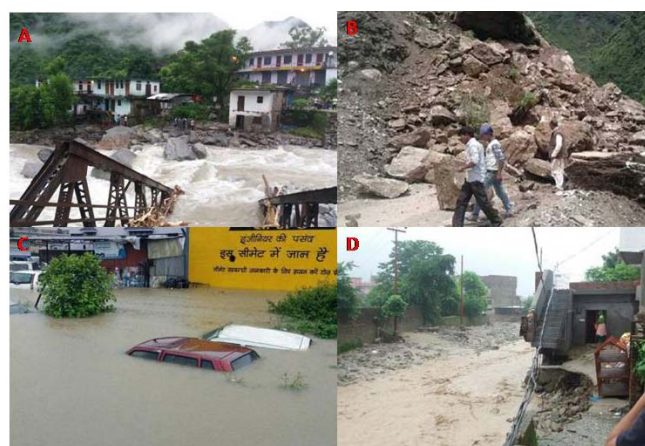
Fig. 2 A. Bridge collapsed due to flashfloods in Kanar village, Pithoragarh; B. Huge landslide on the Gangotri pilgrimage road; C. Roads are over flooded due to cloudburst-triggered floods in Dehradun city; D. Houses collapsed along the seasonal Nala in Kotdwar due to cloudburst (All these incidences occurred in the second week of August 2017)

In the second week of August 2017, cloudburst-triggered flashfloods and landslides have devastated Malpa village, Kotdwar town, and Dehradun city where a number of people died and huge property was damaged (Fig. 2).