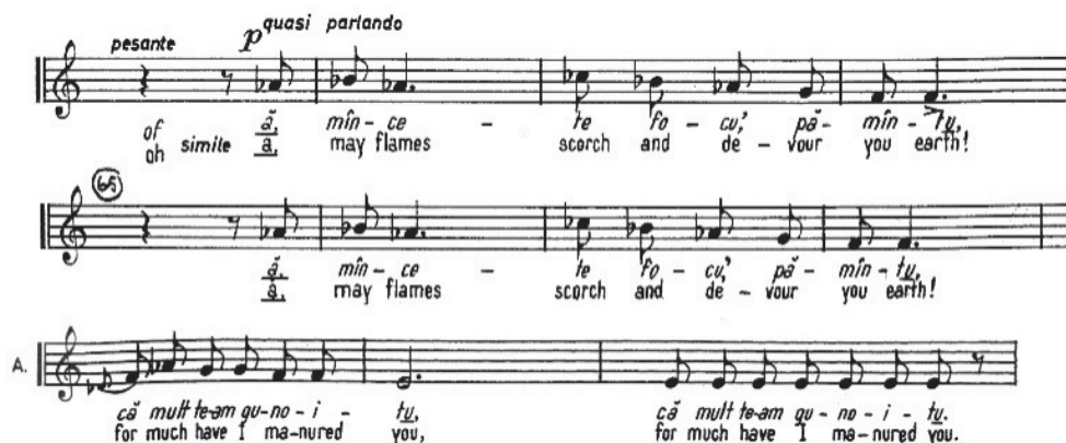
Fig. 4 Mânce-te focu, pământ (May flames scorch you), Bihor county, collected by Béla Bartók; (Alexandru Pașcanu – Bocete străbune / Old laments, p. 9 [4])