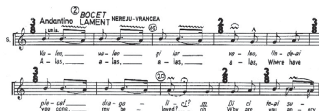
Fig. 2 (a) Bocet (Lament), Nereju-Vrancea county (Alexandru Pașcanu – Bocete străbune / Old laments, p. 5 [4])