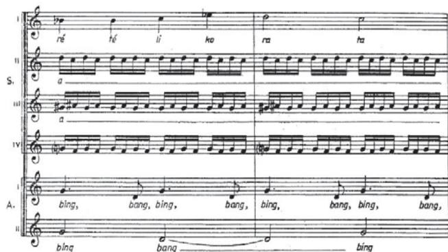
Fig. 9 Alexandru Pașcanu – Festum hibernum. Străvechi tradiții ciclice! Festum hibernum. Ancient Cyclic Customs, R 1 +2 , p. 4 [5]

For instance, right in the opening part, the melody of the carol O, ce veste minunată! (Oh, what wonderful news!) – a simple diatonic structure centred on B flat –, is wrapped in a mobile cluster that has a significant chromatic density (Fig. 9).