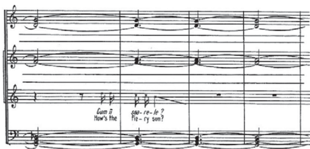
Fig. 6 Alexandru Pașcanu – Bocete străbune/ Old laments , p. 6 [4]