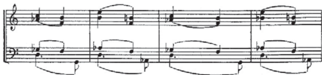
Fig. 7 Alexandru Pașcanu – Bocete străbune/ Old laments , p. 9 [4]

All the harmonic-polyphonic instantiations delivered within are projections derived from the verticalization of the (horizontal-)modal structure of the laments, supplemented, in a one-of-a-kind, original “staging”, by (complementary) elements which amplify the chromatic dimension of the sonority. Yet, besides all these highly expressive procedures (in the direction of the piece’s psychological-philosophical connotations), we should also highlight the tendency to actually dramatize the musical discourse, either through “thematic” counterpoint (rendering two lament melodies at the same time, Fig. 8) or through the generalization of the rhythmic declamation in the text by most of the choir ensemble (as shown in Fig. 3).