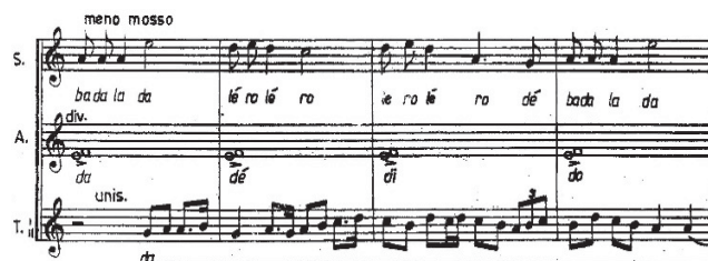
Fig. 11 Alexandru Pașcanu – Festum hibernum. Străvechi tradiții ciclice! Festum hibernum. Ancient Cyclic Customs, R 9 +4 , p. 12 [5]

The first (Fig. 11) refers to the original manner of building a heterophonic sonority produced, in these circumstance, by the simultaneous rendering of two well-known carol melodies: Doamne Iisuse Hristoase (Our Lord, Jesus Christ) – Soprano and Trei crai de la răsărit (Three Kings from the East) – Tenor. It should also be noted that the heterogeneity of the heterophonic structure itself is amplified by an intermediate minor second pedal (Alto), which is afterwards developed into mixtures of perfect fourths.