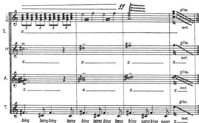
Fig. 10 Alexandru Pașcanu – Festum hibernum. Străvechi tradiții ciclice! Festum hibernum. Ancient Cyclic Customs, R 10 -4 , p. 13 [5]

The moment is re-edited (Fig. 10) through amplification at the level of the total chromatic (density 12), a systemic limit reached through the complementariness of the heptachord diatonic level (density 7), and the anhemitonic pentatonic level (density 5).