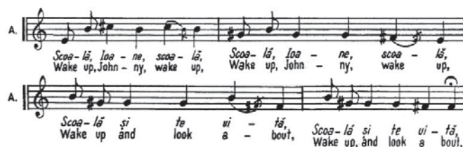
Fig. 1 Zori (Dawn), Oltenia county, collected by Constantin Brăiloiu (Alexandru Pașcanu – Bocete străbune / Old laments, p. 1 [4])

In the piece Bocete străbune (Old laments) – choral poem on folk verses for mixed choir, toaca, chimes and timbales – the composer Alexandru Pașcanu re-enacts in a symbolic manner the mood of the ancient funeral rite, quoting four authentic laments collected from different geographic areas of Romania. Toaca is an percussion instrument (non-tunable) made out of a wooden board that is knocked on with two specific drumsticks. Academic music took the instrument from the church-related practices of the Eastern Church, where the toaca may be mobile or made out of metal.