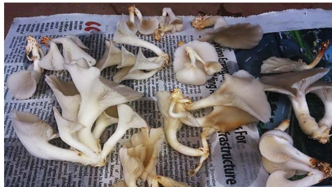
Fig. 2 Freshly Harvested Fruit Bodies of P. ostreatus 26 Days after Spawn Inoculation

(13.75), highest mean CD (5.64 cm), highest FW (51.01 g), highest BE (102.02%) and highest PR (4.09 g per day). Significant differences ( P \leq 0.05 ) were observed in CD, FW, BE and PR among the evaluated sterilization methods.