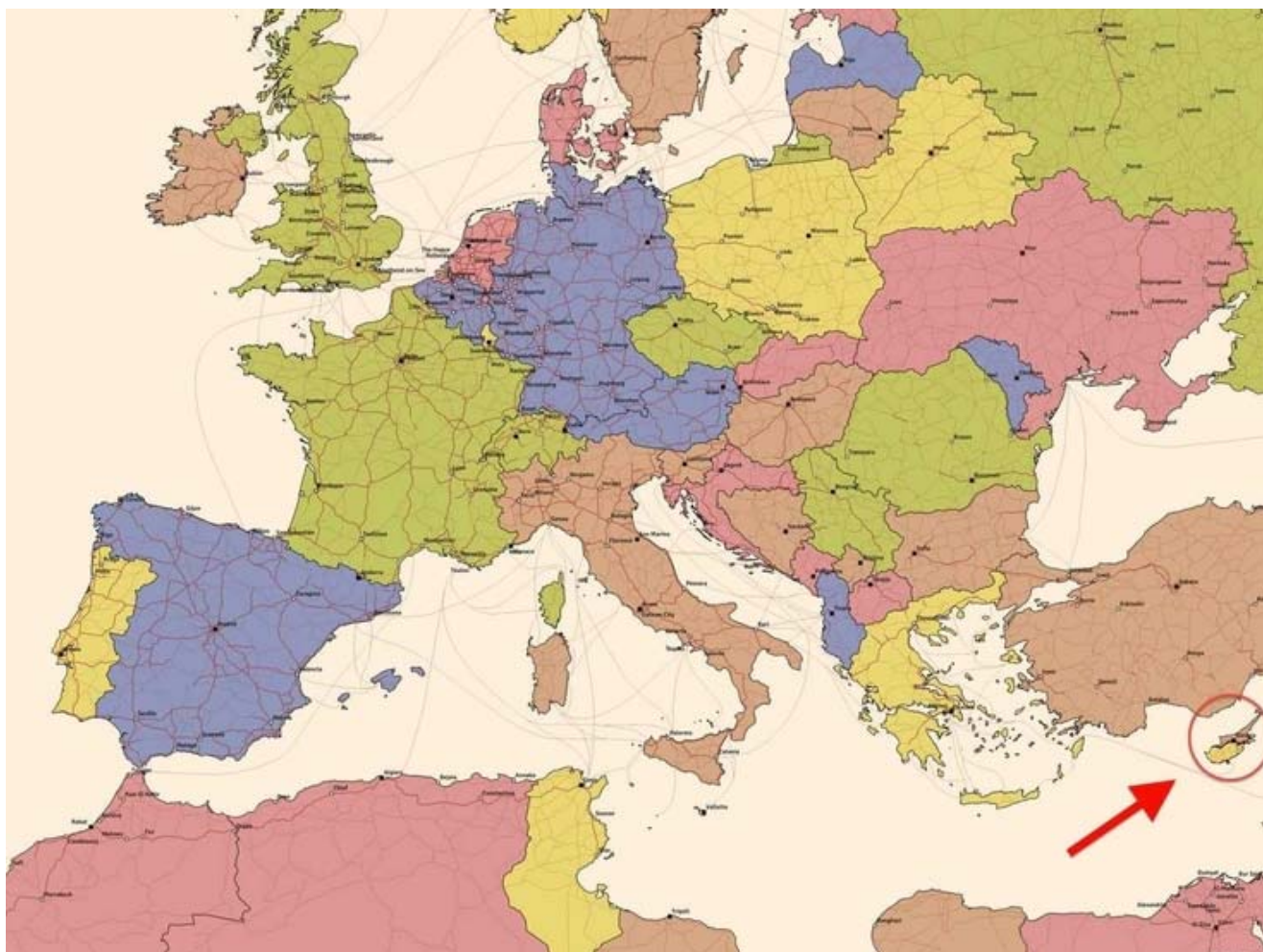
Fig. 2 Geographical location of Larnaca/Cyprus and Athens/Greece

Observations on data analytics on the specific window sample show there is a daily direct flight from Larnaca Airport to Athens International Airport. The carriers serving the direct connection between Larnaca and Athens are four, and they are Aegean Airlines, Cobalt, Blue Air and Hahn Air, while the connection between Pafos and Athens is served only by Cobalt.