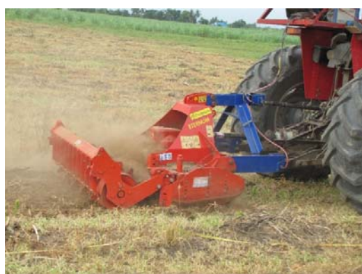
(b) Power harrow