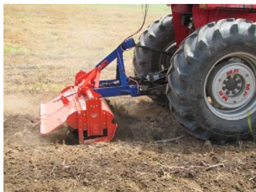
(a) Rotary tiller

Tokyo, Japan) a 16 channels strain amplifier was used to amplify the signals, recording signals were saved in the internal memory and on the laptop. For reading data from the laptop or CF card, the DCS-100A data acquisition software was applied. Statistical analysis of the split-plot design was applied to evaluate the significance of the treatment effect on mean soil clod diameter. Also the forward speed, the tilling depth, force and power parameters were statistically analyzed.