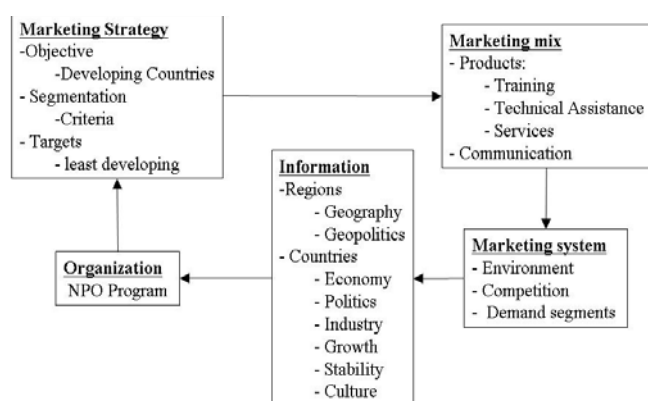
Fig. 1 NPO program is organized in pan-regional strategy developed in five interacted procedures. These form a loop that starts with the strategy and then followed by the marketing mix, marketing system, and collection of information and actionable plane that confirms the strategic moves

education, urbanization, lifestyles, advances in information and communication technologies, and the increasing flow of labor, money, and technology across borders and life style. Despite the heterogeneity of these countries (language, culture, socio-demographic, ethnic, politic, etc.), they do have lot in common that helps structuring these differences [8]. These make it easier to integrate pan-regional strategy developed in five interacted procedures. These form a loop that starts with the strategy and then followed by the marketing mix, marketing system, as well as collection of information and an actionable plan that confirms the strategic moves (Fig. 1). The results clearly point to countries where an NPO Program must be implemented first, and more specifically, which area of interest must be targeted on the basis of the defined criteria.