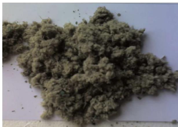
Fig. 3 Treated HCRW [14]

normally then sold, or given away for free to industries who can burn it as fuel [13]. Although there are a number of RDF plants in the world, to date none has been erected in South Africa, and a market for the RDF would have to be investigated and developed first, as well as assessing any environmental impacts if this fuel is burned in normal burners.