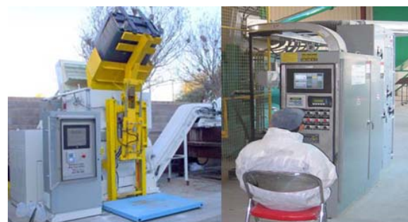
Fig. 1 PIWS non-burn HCRW Treatment System [7]

PIWS non-burn HCRW treatment technology has an on-board computer interface that monitors the entire process, as shown in Fig 1. The operator stages and loads the waste directly into a feed hopper.