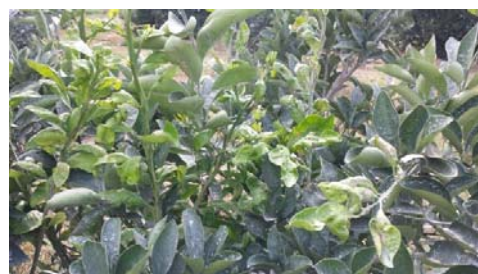
Fig. 1 Infected leaves of Dashte Naz agro-industrial company citrus orchards

Data on pupal mortality, longevity of both male and female moths, total number of eggs per females and egg hatch in each replication were recorded.