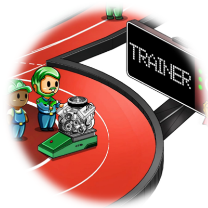
Fig. 5 Trainer-based engine assembly training

We present our research contributions to the scientific community as well as to management audiences (guideline 7).