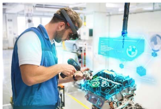
Fig. 1 AR-based engine assembly training using a HMD