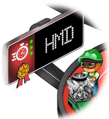
Fig. 4 HMD-based engine assembly training