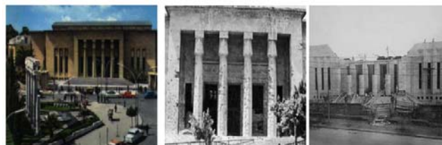
Fig. 6 Beirut National Museum, before/during/after the civil war (1975-1991) [7]

The building of Swat Museum was destroyed partially and showcases were totally destroyed during the conflict. The head of the project and co-director of Istituto Italiano per l’Africa e l’Oriente (IsIAO), has recommended a traditional style of architecture for the reconstruction. In this regard, the cultural park will be a landmark in Swat’s history, and clearly, the archeological sites will be protected there. It will develop tourism and increase public attention about the protection of cultural heritage. Protection should be given to all the adjoining places where archaeological sites stupas are located.