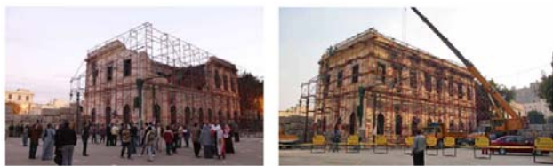
Fig. 16 Reconstruction of the Building Sheikh Sultan Al Qassimi, Governor of the Emirate Of Sharjah