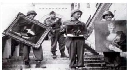
Fig. 4 Move (some or all) of the collections to safer premises [5]