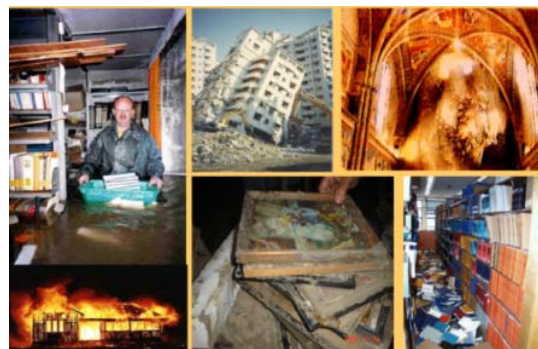
Fig. 2 Potential threats for Heritage cycle [4]