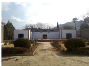
Fig. 9 Ongoing re-building and rehabilitation of Swat Museum by the Italian work [8]