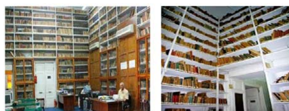
Fig. 14 The huge collection (over 35,000 volumes) of unique and ancient references in the Institute

The Institute financed the work of scholars and technical professionals of the Commission des Sciences et des Arts. On 22 nd November 1799, the Institute decided to collect and publish its scholarly work as the Description of Egypt. The Institute continued till its 47 th and last meeting on 21 st March 1801.