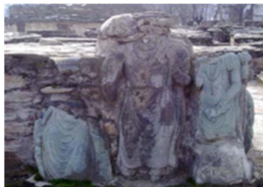
Fig. 7 Butkhara, a historic site next to Swat Museum (Pakistan) containing the unique ruins of Buddha, was partially damaged by shooting during the military operation [8]