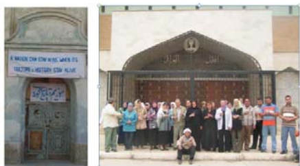
Fig. 3 The first step is close down [5]

The objects may be damaged in transit or as a result of improper storage in the new building, which can place the collection at threat of damage from humidity, pests, and etc. This highlights the importance of a solid contingency plan in which an evacuation is anticipated and planned for. Often, a library, archive or museum has enough space in another location to safely store their collection in case of emergency. In all cases, the mistake is usually made of transmitting materials to surroundings that do not meet the minimum preservation standards [5].