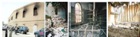
Fig. 10 House of Wisdom, Iraq [4]