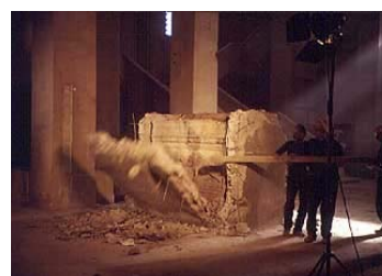
Fig. 5 Beirut National Museum. Rehabilitation after the civil war (1975-1991). Removing the cement box which covers a Roman Sarcophagus [4]

If help is required from or offered by various organizations, fragmentation of assistance can lead to duplicated efforts and a lack of information. To avoid that, heritage institutions that are in danger could be linked up with one foreign heritage partner only. This idea has already been practiced by the American Museum organization and Middle East Librarians organization. The familiar work between Twin and Sister Cities is called twinning [5].