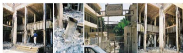
Fig. 12 National Library [4]