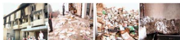
Fig. 11 Central al-Awqaf Library [4]