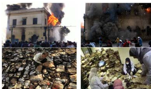
Fig. 15 The Institute was destroyed by fire 17 th December 2011

It was reported incorrectly that the original manuscript of the 20-volume Description de l' Égypte (1809–29) was damaged during the conflicts in 2011 (Fig. 15). Most of the original manuscript material for the description resides in the Paris National Library and National Archives.