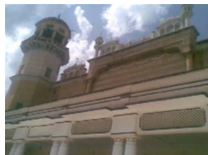
Fig. 8 Intangible heritage affected during the armed conflicts of 2007-2011: the number of visitors to the Grand Shrine in Saidu Sharif has decreased over security fears [8]