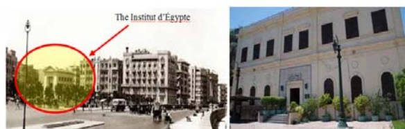
Fig. 13 The Institute of Egypt that is learned academy formed by Napoleon Bonaparte to carry out research during his Egyptian campaign