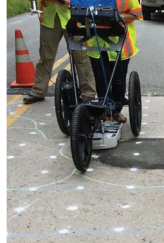
Fig. 1 Picture one of GPR data collection

scale represents the signal amplitude at any given location, and the hyperbolas in the image are the reflections from the reinforcing steel. The peak of each hyperbola is the location used for the evaluation since that is the actual location of the rebar. The left red circle in Fig. 3 is an area that contains potential damage, whereas the right red circle is an area free from deterioration. The difference between these two areas is the ability to clearly see the hyperbola’s peak, in addition to its brightness. This is directly related to the amplitude of the signal at that location. Areas of potential damage have lower amplitudes than those free from damage.