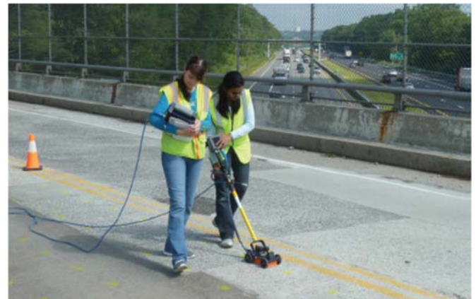
Fig. 2 Picture two of GPR data collection