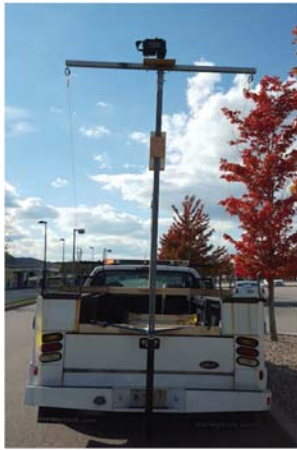
Fig. 4 IR Setup

Infrared thermography works by collecting emitted infrared energy, in the form of temperatures (degrees F), from the surface of the deck using an infrared camera mounted onto a vehicle, about 12-13ft above the surface (Fig. 4). The surface temperatures vary when a delamination is present within the subsurface. Since a delamination is an air pocket, it acts as an insulator for that location of the deck. So as the ambient air temperature rises early in the day, the delaminated area will heat up quicker than an area free from damage and appear as a hot spot.