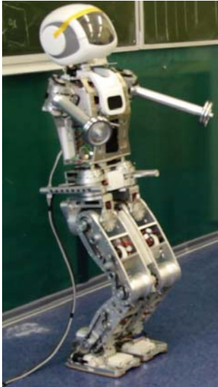
Fig. 3 The anthropomorphous robot AR600

particular link and the system as a whole. Usually in this case, robust PID – regulators, which cannot always provide stability of all system, are used. Therefore, development of methods for the synthesis of stable modes of the movement in multidimensional mechanical systems remains relevant.