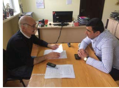
Fig. 3 Sociological Survey in Tetrtskaro Municipality

Considering the goal and the objectives of the study, qualitative research method was used. Survey was conducted using focus group (group discussion) method. Group discussions were organized prior to the survey by key personnel of the project in collaboration with local municipalities. Each focus group consisted of 6-8 locals who were intensively engaged in agricultural activities. A guideline for the group discussions was designed by the key personnel (sociologist) of the project in collaboration the experts from the relevant area of the study. The semi-structured guideline included approximately 15 questions. The focus groups were led by a moderator. In total 4 focus groups will be conducted in Tetrtskaro municipality: One focus group was conducted in municipality center and 3 focus groups were conducted in different villages of the municipality. The lengths of the discussions were around 1.5 hours. The focus group discussions were recorded on an audio tape. Recorded group discussions were transcribed. Obtained data was analyzed in the framework of code categories developed based on transcripts. Survey followed all ethical standards of the social research. The study shows that only some of the settlements of the municipality have integrated water supply system.