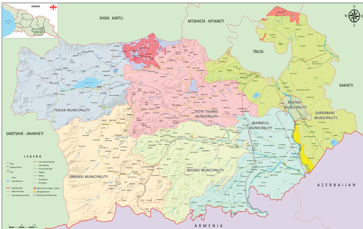
Fig. 4 Study Area