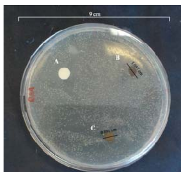
Fig. 1 Evaluation of the inhibitory effect of SDF on S. mutans : A) Resin-based fissure sealant without SDF incorporated (control); B) Resin-based fissure sealant with 12 % SDF solution and C) Resin-based fissure sealant with 30 % SDF solution

inhibited the bacterial growth after 24 hours. The determination of the inhibitory halos surrounding the samples was assessed. In the sample containing the resin-based fissure sealant with 12 % SDF solution (sample B) the inhibitory halo had a diameter of 1.06 cm while the sample containing the resin-based fissure sealant with 30% SDF solution (sample C) had a 0.89 cm inhibitory halo (Fig. 1). Therefore, no statistically significant differences were found between the inhibitory halos obtained for samples B and C. Moreover, SEM images of the surfaces of the materials were also acquired in order to fully characterize bacterial growth on the materials surface (Fig. 2). As it can be seen, no bacterial growth was noticed on the surfaces of the materials. The authors found that the cured sealant containing SDF had an inhibitory effect on the growth of S. mutans , but also the control sample (sample A) did not show any detectable bacterial growth. Further studies have to be done in order to check the antibacterial activity of the produced materials.