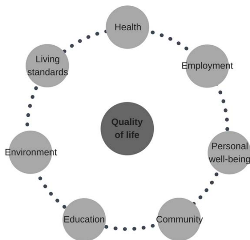
Fig. 3 Dimensions associated to quality of life

All of these dimensions are shaped by subcategories that appear in the three measures of the sample, so although every of them focus slightly differently on quality of life, from a frequency point of view they all make reference to the same issues (see Fig. 3).